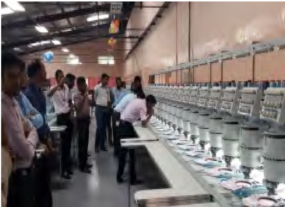
Textile factory in Sri Lanka