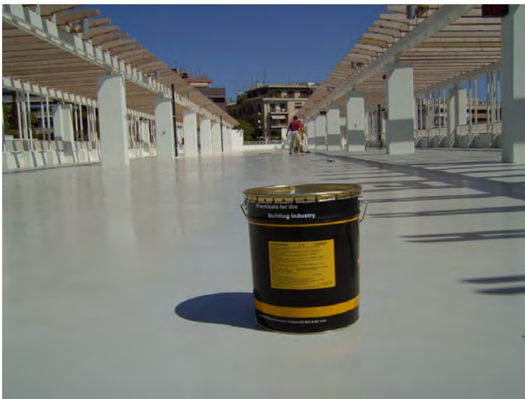
EXPOSED CAR PARK

To waterproof and protect an exposed car park is one of the most challenging applications that a professional can face because the outcome must offer high waterproofing standards and the surface needs to withstand many challenges such as strong mechanical stresses, heavy traffic, contact with volatile chemicals and temperature variations. The car park project in Greece had a lot of particularities regarding the surface that needed to take care of.